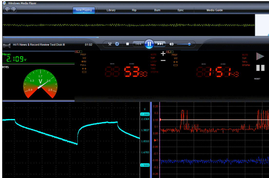
Fig1: Screenshot of Dialog's DA7210 Class G-ClassAB discharge demo suite

A screengrab of this setup is shown below. The voltage meter and discharge is shown in the left hand panes, on the bottom right pane the oscilloscope shows one headphone channel output (blue) and the corresponding Class G positive rail (red). The timers capture the supply capacitor discharge from approximately 2.1V to 1.85V.