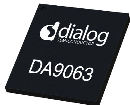
Available in 100 VFBGA 8 mm x 8 mm x 1 mm, 0.8 mm pitch

The low-power Real Time Clock (RTC) with an external crystal oscillator provides time-keeping, alarm and wakeup functions. In addition, a watchdog timer is included for system monitoring purposes.